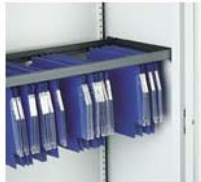
Lateral Filing Rail

1968x 1000 x 470 Does not include internals Will accept any standard internals