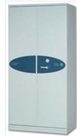
Phoenix 30 minute Fire Rated Cupboard 1612