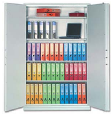
Phoenix 30 minute Fire Rated Cupboard 1613