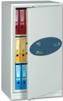
Phoenix 30 minute Fire Rated Cupboard 1611