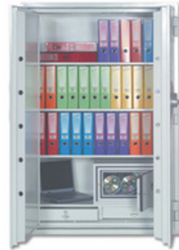
Phoenix 30 minute Fire Rated Cupboard 1900