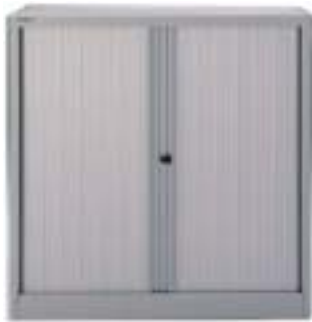
Bisley Side-Opening Tambour Cupboard