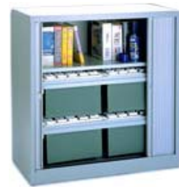
Bisley Side-Opening Tambour Cupboard