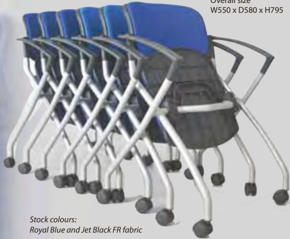
Stock colours: Royal Blue and Jet Black FR fabric